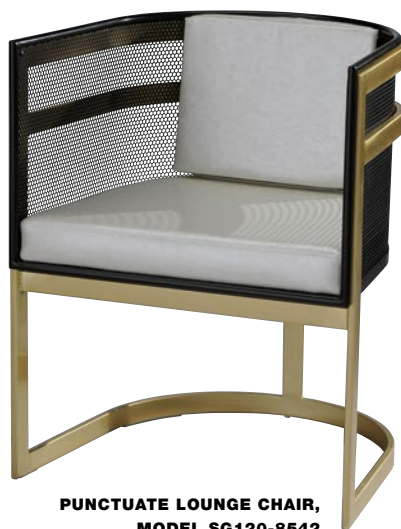
PUNCTUATE LOUNGE CHAIR, MODEL SG120-8542