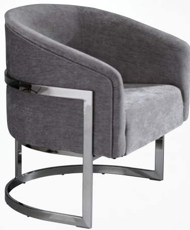
LOUNGE CHAIR, MODEL 8000

Large lounge chair with metal frame and upholstered shell