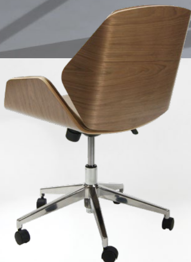
ELLIE PEDESTAL CHAIR, MODEL 8650-C-WFWSBP