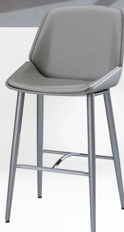
ELLIE BARSTOOL, MODEL 8618-30-V