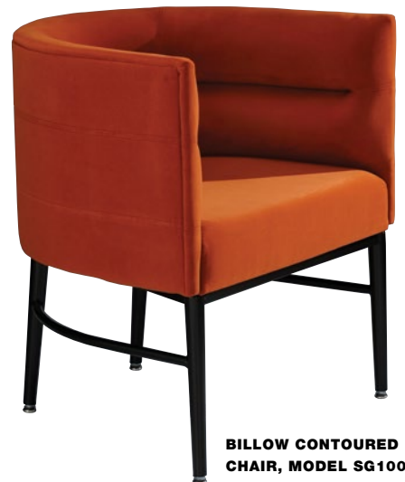
BILLOW CONTOURED LOUNGE CHAIR, MODEL SG100-8608