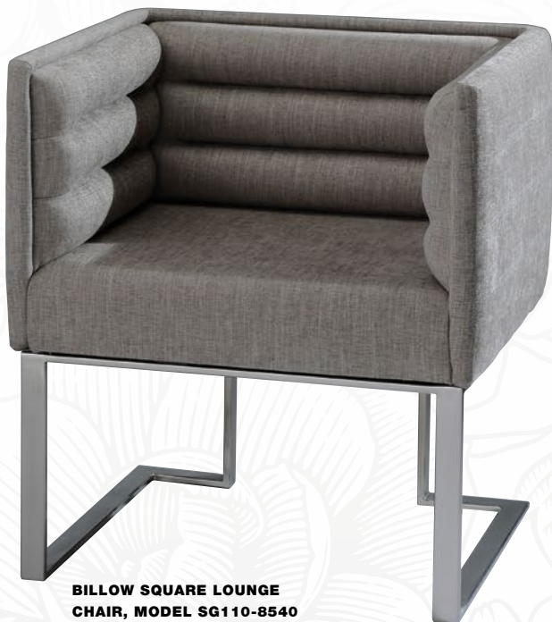
BILLOW SQUARE LOUNGE CHAIR, MODEL SG110-8540