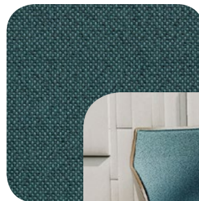
MELD , COMET ON INESSA , MODEL WL01-U1FWBP