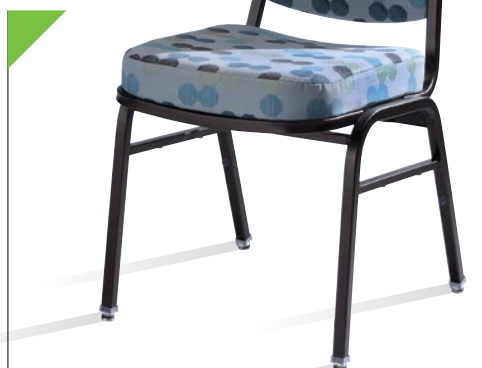
COMFORTFLEX® OMEGA II CF582

The result was equipping the entire facility with our Omega II Stackers, which are built to our SynerGreen standards—highly recycled content, easily recyclable, and earning GREENGUARD Certification.