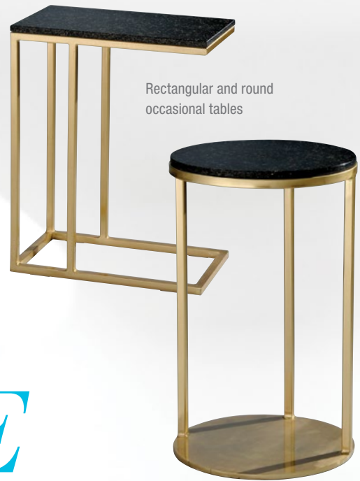
Rectangular and round occasional tables

Every jaw-dropping piece in The Art of MTS gallery is connected by brushstrokes of genius in innovation, quality, and comfort. And the latest additions to our Guest Room & Public Space Seating, including the Billow and Punctuate models from Stacy Garcia, and our dining collections build upon that legacy while allowing each piece to create an essence of its very own. Flowing with sharp new features, dynamic design choices, and contemporary influences, we've completely reenergized classic lines with simple accessories, and created never-before-sat models that define the modern day.