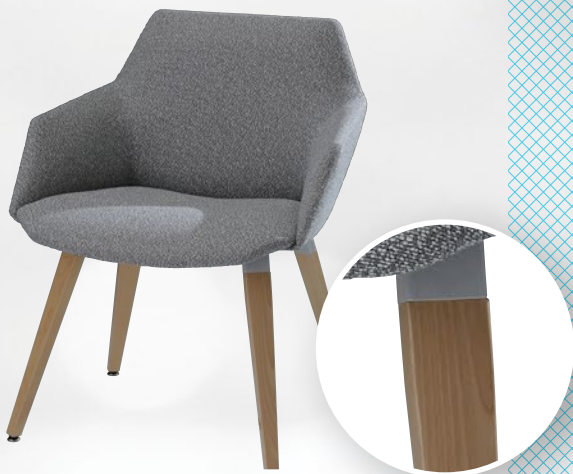
PARAGAMI, MODEL WL50-B

Paragami and Ellie are now available with our new rectilinear legs as well as original tapered round wood legs